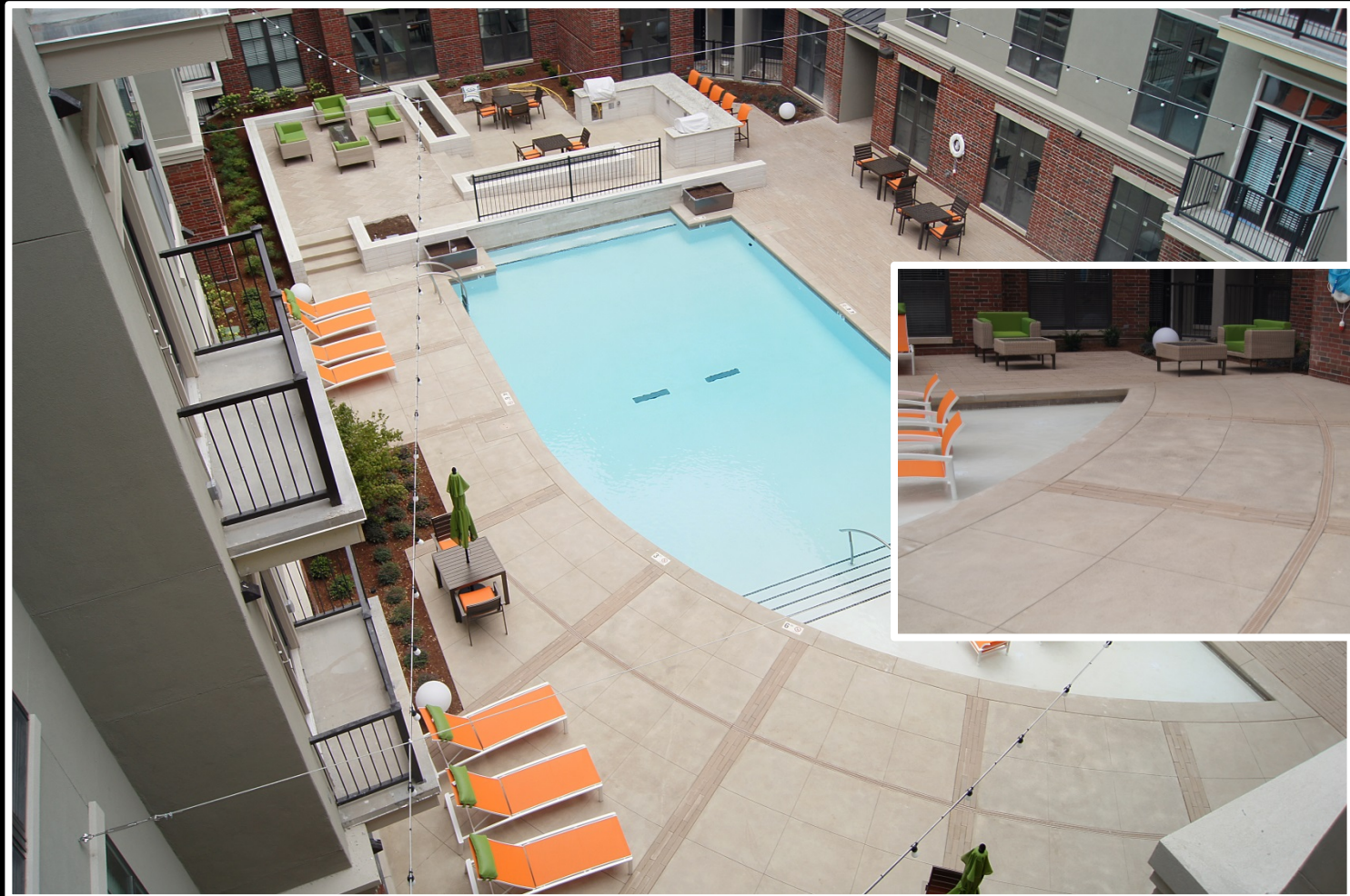
Project Location – Oklahoma; Bomanite Exposed Aggregate System – Alloy