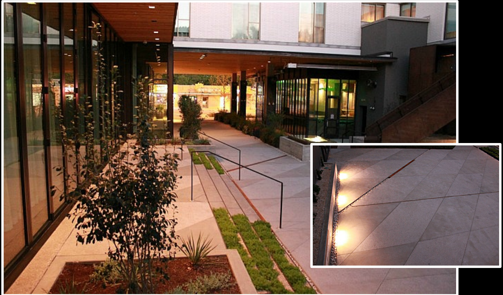
Project Location – Texas; Bomanite Exposed Aggregate Systems - Sandscape Texture