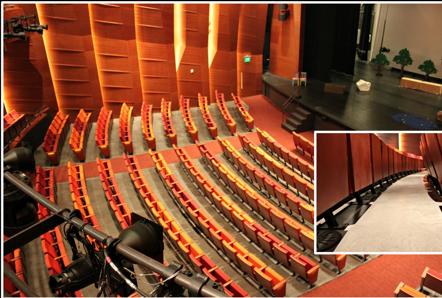
Project Location – Texas; Bomanite Toppings System - Micro-Top