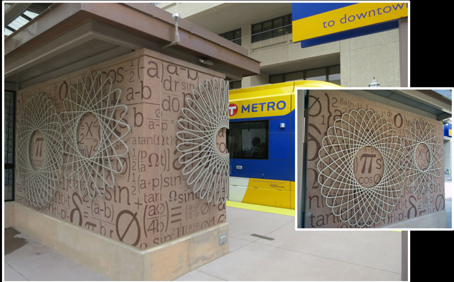
Project Location – Minnesota; Precast Sandblasted Panels