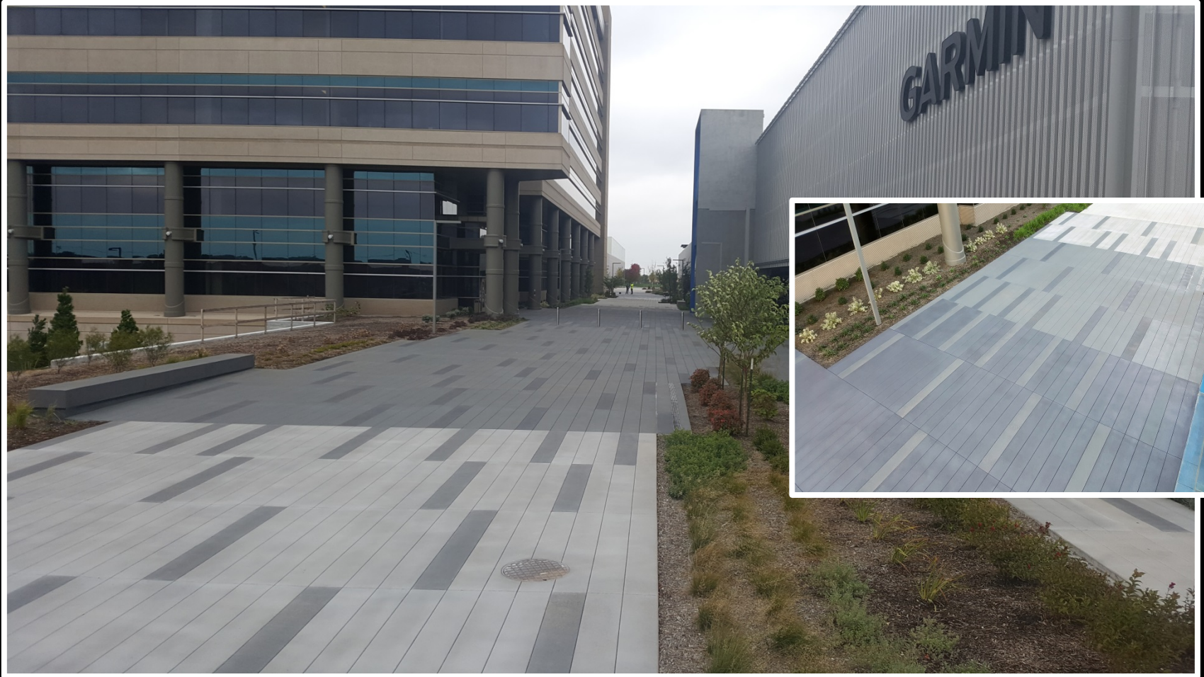
Project Location – Missouri; Bomanite Exposed Aggregate System – Sandscape Texture