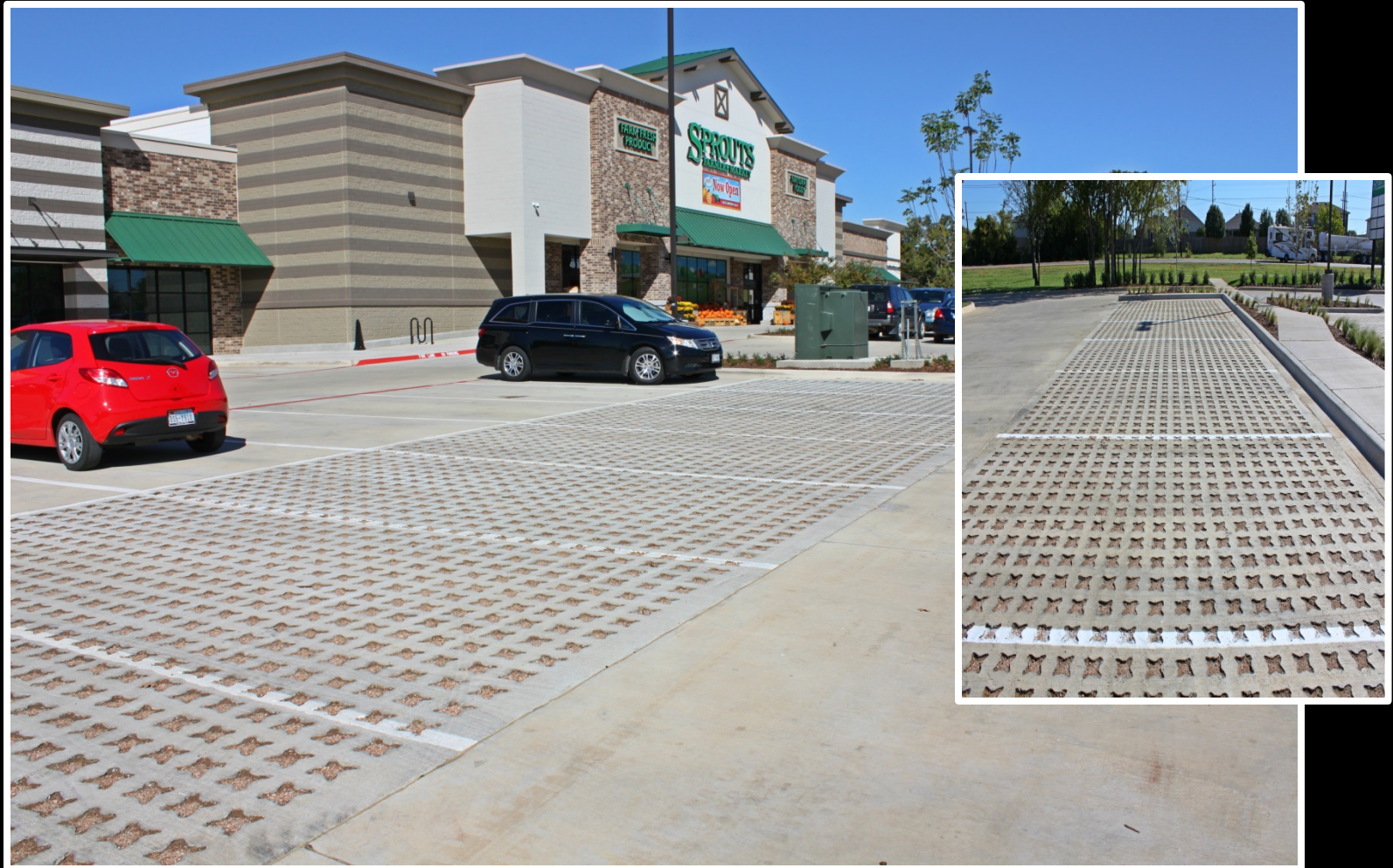
Project Location – Texas; Bomanite Grasscrete System – Stone Filled