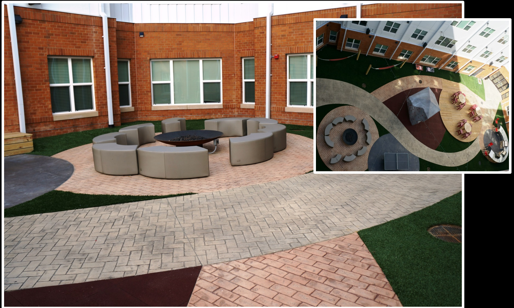
Project Location – Nebraska; Bomanite Imprint System; Pattern – Herringbone Used Brick, Running Bond Used Brick