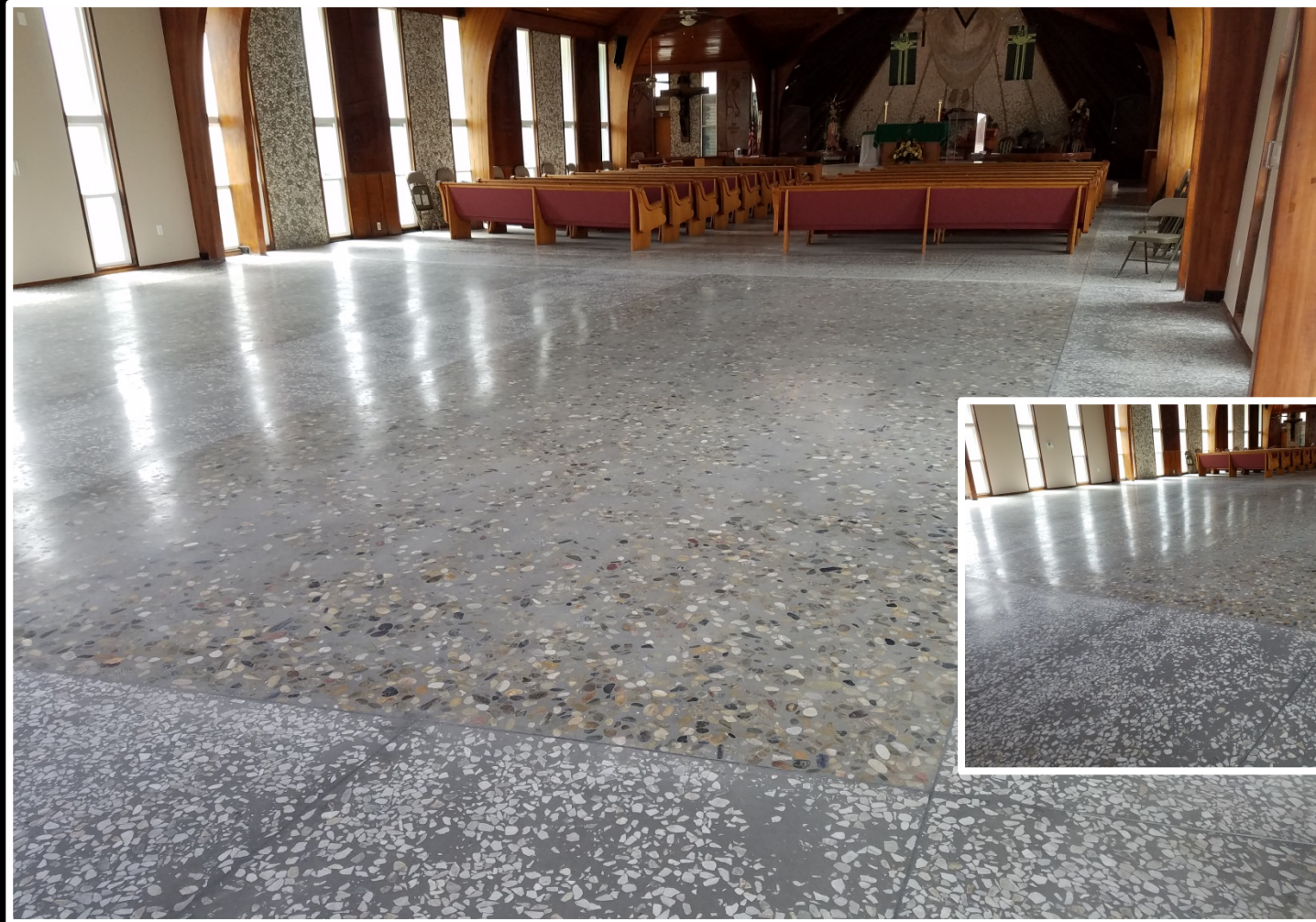
Project Location – California; Bomanite Custom Polishing System – Modena