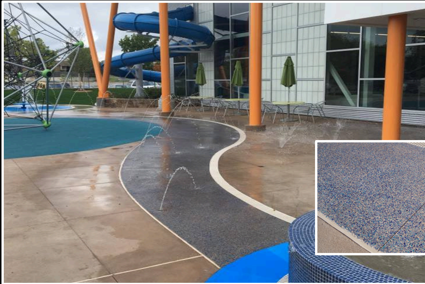
Project Location – Oklahoma; Bomanite Exposed Aggregate Systems - Bomanite Revealed and Sandscape Texture