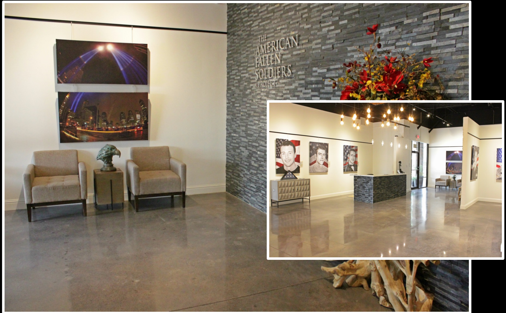
Project Location – Texas; Bomanite Custom Polishing System – Patène Teres