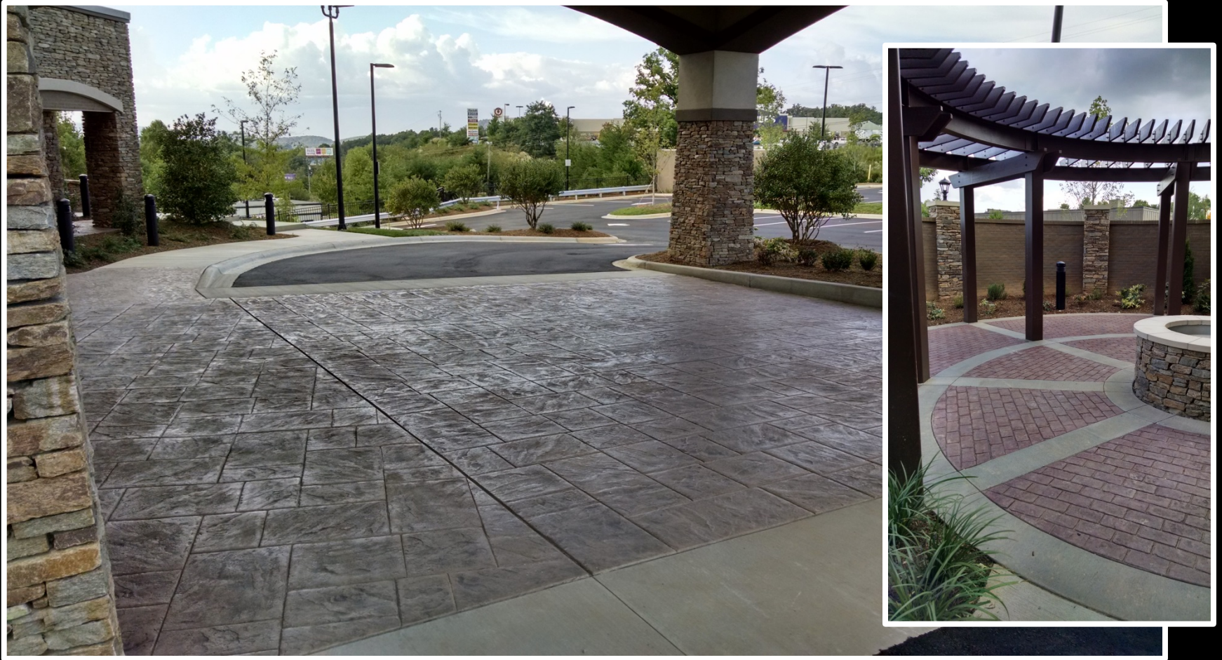
Project Location – North Carolina; Bomanite Imprint System; Pattern – English Sidewalk Slate, Slate Texture, Used Brick