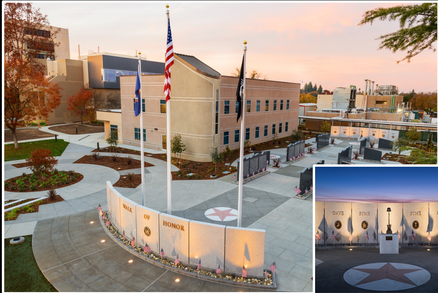
Project Location – California; Bomanite Exposed Aggregate System – Sandscape Texture